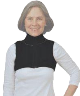
TT-NK: Upper Torso

This dickie is designed to provide circumferential coverage at the level of the axilla. It is perfect for addressing areas that usually are difficult to apply therapeutic compression to. Problem swelling in the upper breast or below the clavicle can be addressed, as well as swelling above the clavicle or encroaching into the neck. This piece can also be worn to address induration due to radiation fibrosis in the chest, neck and clavicular areas.