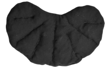
SP-08 Kimbe Swell Spot

This larger Swell Spot was designed to reduce swelling over the scapula (shoulder blade) area, with the pad tucked into the shoulder and back straps of the user's bra. We have also had patients use this to soften breast fibrosis after a lumpectomy. It is extremely versatile.