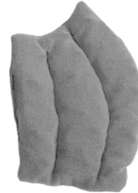
SP-16-B Full Bra

This smaller Swell Spot was designed to be tucked into bra pockets or directly into a bra without pockets. It can be placed as needed to address specific areas of fibrosis and swelling.