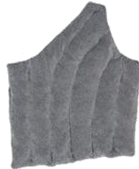
SP-16-A Lateral Bra

The Full Bra Swell Spot was originally designed to be inserted into compression bra. This Swell Spot works to reduce fibrosis and swelling of the full breast and can be inserted into any front opening bra.