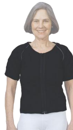
TT-NH: Short Sleeve Shirt

If truncal edema is a problem, this shirt can address it. The torso portion of this garment is created with vertical channels while the sleeves are made with chevron channels.