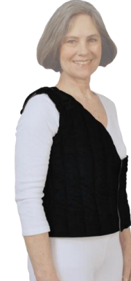
TT-MK: Thoracic Sling Wrap

The asymmetrical thoracic wrap was client-designed specifically for unilateral mastectomy, providing therapeutic relief from chest wall scarring, radiation fibrosis and swelling over the scapula. It can be ordered with a detachable Tribute sleeve.