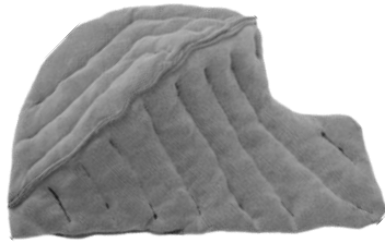
SP-09 Breast Swell Spot

This Swell Spot is designed specifically for swelling and fibrosis in the breast area after lumpectomy or reconstructive surgery. It is meant to cover the breast and the lateral trunk inferior to the axilla.